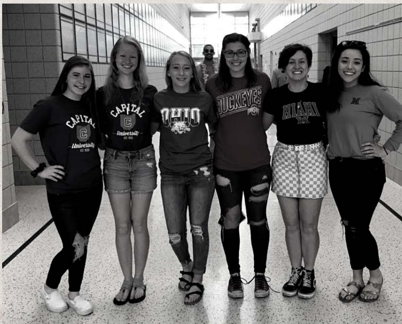
Author photo: (Last day of high school - Wear Your College Shirt Day)