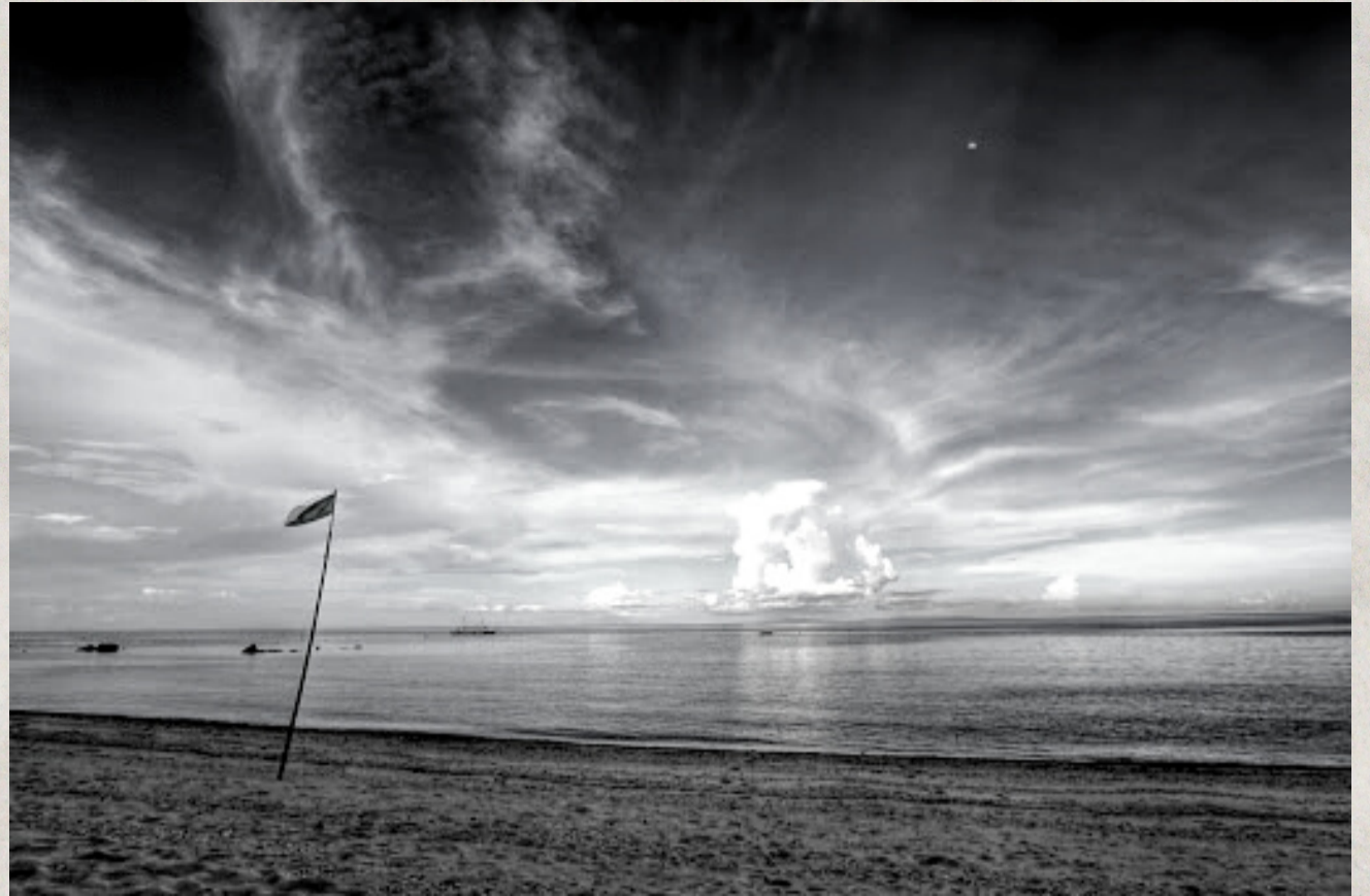
"Blue Skies, White Clouds" by lipjin is licensed under CC BY-NC 2.0. To view a copy of this license, visit https://creativecommons.org/licenses/by-nc/2.0/?ref=openverse .

Interstellar continues to play with the idea of the future, the past, and what time really is when Cooper flies his ship into Gargantua, the black hole mentioned earlier. It seems completely foolish, and even his robot companion makes a few