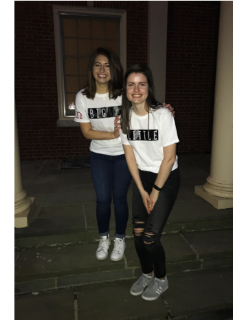
Big/Little Reveal 2018 will forever be one of my favorite memories during my time at Miami!

Life is always going to throw us curveballs; these curveballs can present themselves as triumphs, failures, challenges, and opportunities. We turn these curveballs into home runs because of the supportive communities in our lives. I am not the same person that I was on move-in day my first year at Miami; I have blossomed into a more confident, driven, and empathetic woman with a greater sense of mission and purpose because of the network I have found here. I share these anecdotes