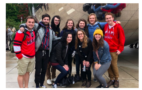
Sketched Out's Annual Trip to Chicago on October 2018.

went from thirty auditionees to five of us left. I had a blast playing each game and getting to know the current Sketched Out members and other auditionees. I forgot about the stress of classes, meeting new people, and adjusting to life at school and laughed and smiled more during those two