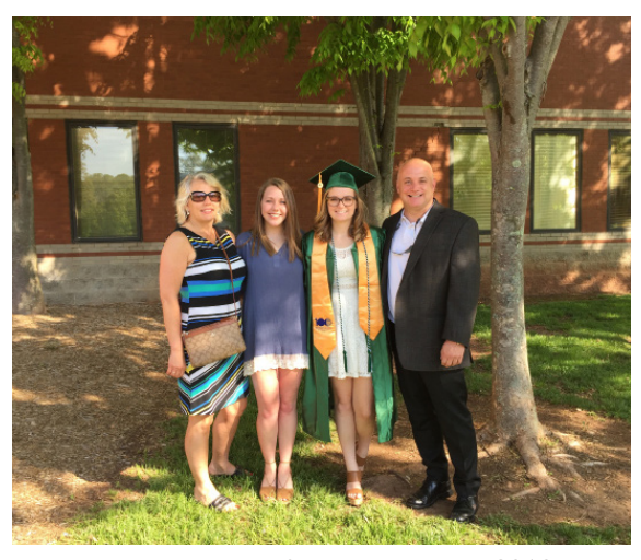
Me, surrounded by my family at my May 2018 community college graduation.

each other to find the score sheet had our names. I searched frantically until I spied my exam. I snatched it off the table and started walking back to my seat. I flipped the front cover and stared in disbelief. I failed. I failed. I failed. I fought back tears and slumped into my seat as my new friends queried each other for answers. One friend turned