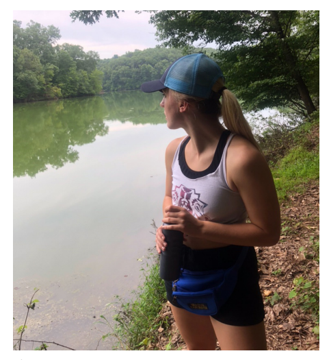
Although there are many great ways to do nothing and take a well-deserved break, my favorite way is by getting in touch with nature!

"doing nothing" in its most literal sense; my favorite form of "doing nothing" is bingewatching Netflix, Hulu, or the most recent season of Game of Thrones. It's "doing nothing" in the sense that my brain gets to take a break from academic work, group projects, or whatever stressors I'm allowing myself to take a break from for that time. It's unfortunate that taking time for yourself has developed a stigma of being lazy when, in reality, it's one of the best ways to decompress.