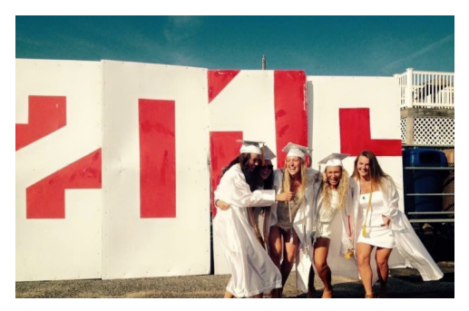
Looking back at high school graduation in June 2015.

You are now in your sophomore or junior year of college, the next chapter of deciding if you want to continue to fit in or if you want to find your own path. A lot can change in the first few years at a new place; by now you