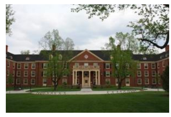
My freshman year dorm, Dennison Hall, where I lived in the basement.

area, so everyone had an idea of what was happening around the hall. When it came to my neighbors a few rooms away from mine, I got to see what it was like to not leave your comfort zone firsthand. In the first weeks of school, I would hang out with each of the two individuals in this room; however, with the individual