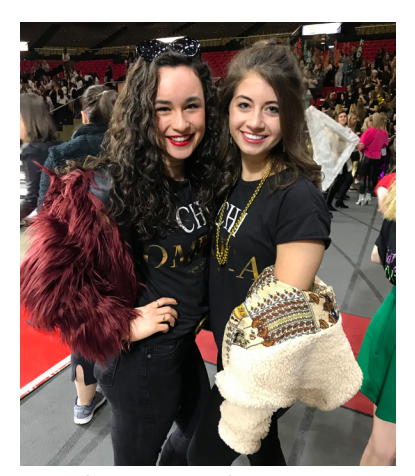
I am forever thankful to have been given the opportunity to lead on Chi Omega's executive board with my best friend.

That September, I arrived back to campus full of growth but also exhausted. Grinding away at the internship application process and my