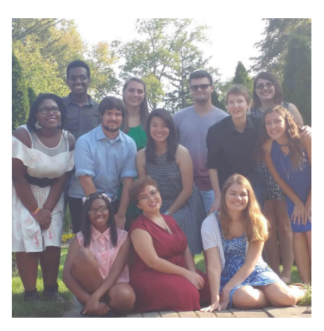
My friends and I in the Formal Gardens for "Family Photo Day" in August 2017.

When I first saw Miami University, I knew I wanted to go there based solely on the scenery. As cheesy as that sounds, I fell in love with the look of