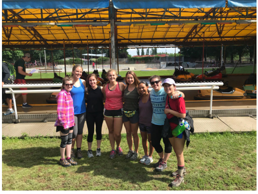
I never dreamed that someday I would get to play bumper cars in Spain with a group of incredible friends I made along the Way. (July 4, 2018. León, Spain.)

I probably never would have received the financial aid to make a study abroad trip like that possible. If I had transferred, I never would have lived out my high school dream of trekking el Camino and be able to proudly display my framed compostela on my wall. If I had transferred, I never would have met the guy I was seeking advice from