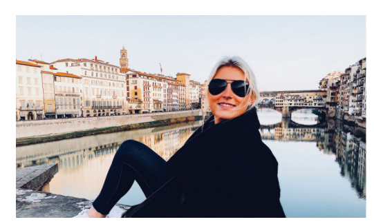
Reflecting on studying abroad in Italy in January 2018, which an advisor had told me to go instead of Australia, where I was originally interested.

Then, before you know it, your college chapter has become almost completely filled with pages and pages of stories, experiences,