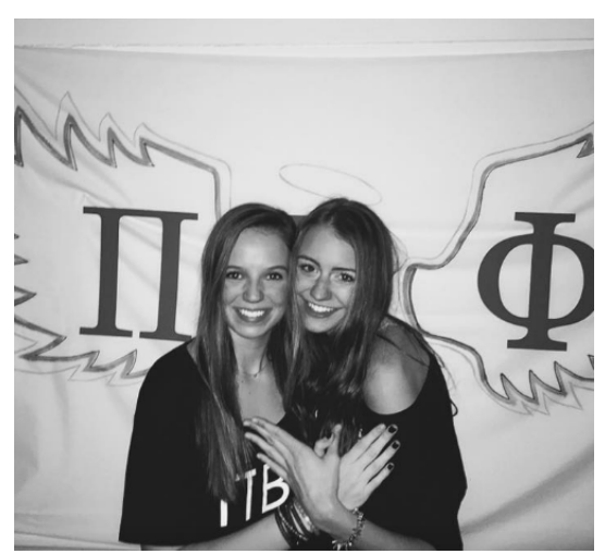
Here is a picture from February 7, 2016, in the Pi Beta Phi suite with one of my sisters, and one of my best friends to this day, on bid day after I rushed.

was not providing the college experience I was seeking, lacking the sorority rush and club involvement that I longed for. In addition, there were only a few majors that interested me after I realized that I did not want to do anything in business, which is the major I enrolled in. On top of it all, I was homesick. That is something almost every college kid experiences, but I was so far away with nobody to confide in, no aspect