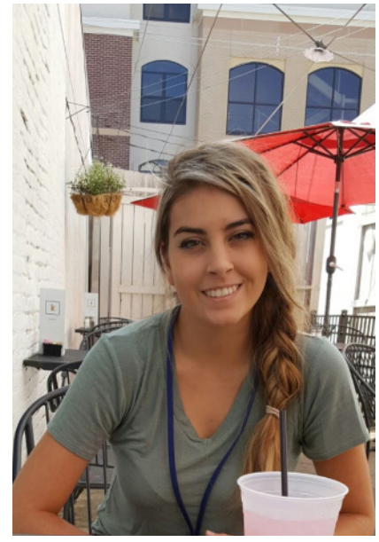
The happiness that comes with finally finding the right major.

working in a research lab and taking several introlevel classes, I quickly discovered that central to psychology is the kind of math I despise most: statistics. While I enjoyed learning about the intricacies of human behavior and of social interactions, every other aspect of psychology gave me a headache. This sent me back into a flurry of uncertainty and anxiety about what to do next, and for the first time I set foot in my advisor's office. This turned out to be the best decision I've made in my time at college.